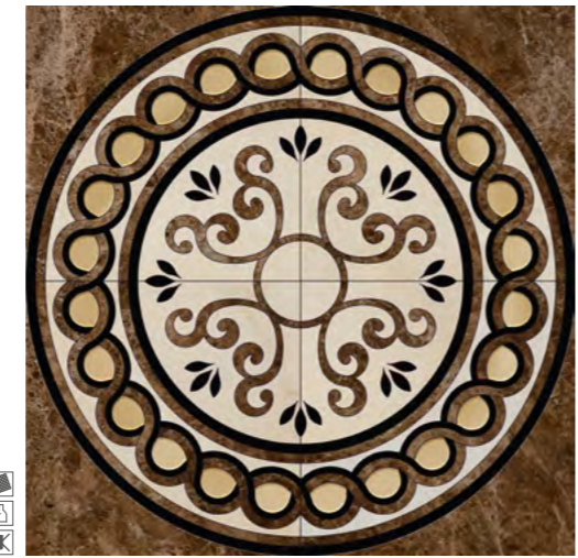
* 13220 ROS. MUSA-M/88/P P-97 (88x88)