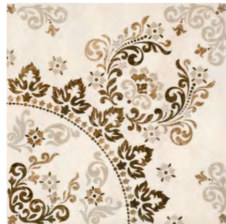
13078 ESTAMBUL-B/60/P B-46 (60x60) (2-0-H)