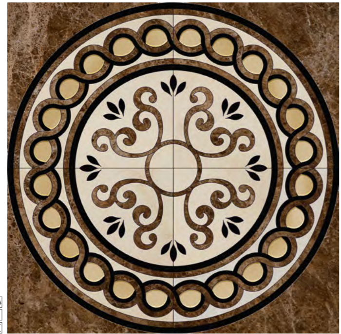
* 13440 ROS. MUSA-M/120/P P-99 (120x120)