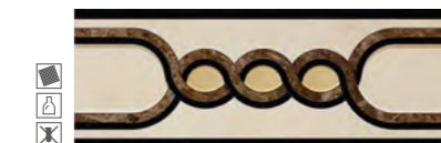
13442 C. MUSA/1/60/P P-72 (22x60)

PETRA-B/44/P PERSEPOLIS-M/44/P L. PERSEPOLIS M/44/P T. PERSEPOLIS-M/44/P ROS. MUSA M/88/P C. MUSA/1/44/P C. MUSA/2/44/P E. MUSA/44/P