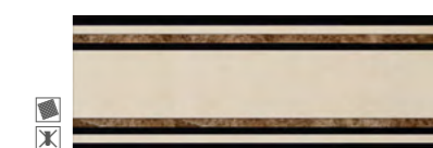
13443 C. MUSA/2/60/P P-64 (22x60)