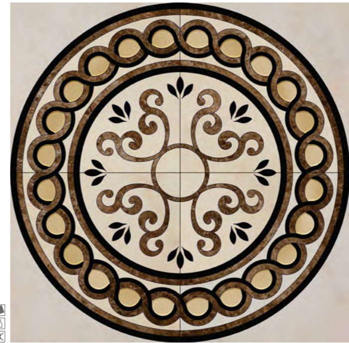
* 13402 ROS. MUSA-B/120/P P-99 (120x120)