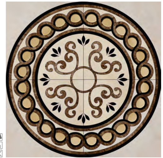
* 13231 ROS. MUSA-B/88/P P-97 (88x88)