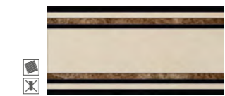
13222 C. MUSA/2/44/P P-62 (22x44)