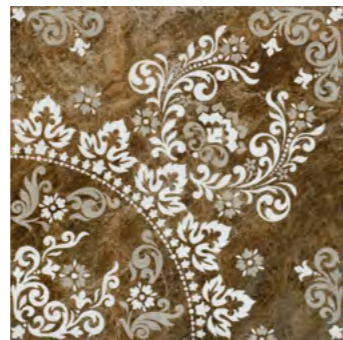
13080 CARTAGO-M/44/P B-43 (44x44) (2-0-H)