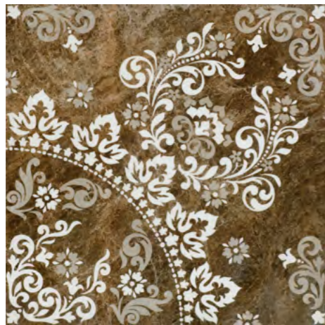
13074 ESTAMBUL-M/60/P B-46 (60x60) (2-0-H)