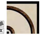
13444 E. MUSA/60/P P-71 (22x22)