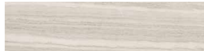
G3066A IVORY RETT. 22,5x90 - 8,8"x35,5" 67 G3069A IVORY LAPP. RETT. 22,5x90 - 8,8"x35,5" 68