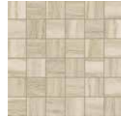
G30511 SAND NAT. MOSAICO 30x30 - 12"x12" 14 G30512 SAND LAPP. MOSAICO 30x30 - 12"x12" 15