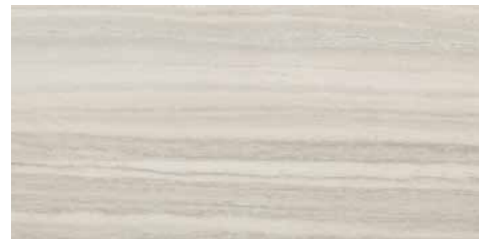
G3052A IVORY RETT. 45x90 - 17,7"x35,5" 65 G3053A IVORY LAPP. RETT. 45x90 - 17,7"x35,5" 66