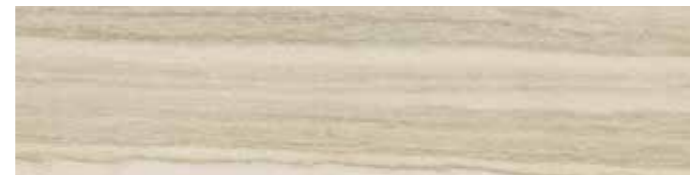
G3067A SAND RETT. 22,5x90 - 8,8"x35,5" 67 G3070A SAND LAPP. RETT. 22,5x90 - 8,8"x35,5" 68