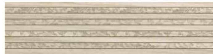
G30844 SAND FASCIA PREINCISA FLOREALE 22,5x90 - 8,8"x35,5" 66