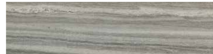
G3065A IRON RETT. 22,5x90 - 8,8"x35,5" 67 G3068A IRON LAPP. RETT. 22,5x90 - 8,8"x35,5" 68