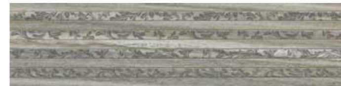
G30855 IRON FASCIA PREINCISA FLOREALE 22,5x90 - 8,8"x35,5" 66