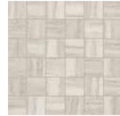
G30509 IVORY NAT. MOSAICO 30x30 - 12"x12" 14 G30510 IVORY LAPP. MOSAICO 30x30 - 12"x12" 15