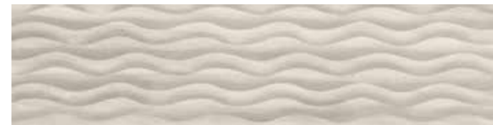
G30800 IVORY FASCIA WAVE 22,5x90 - 8,8"x35,5" 47