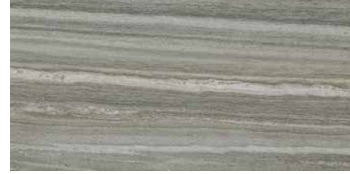
G3050A IRON RETT. 45x90 - 17,7"x35,5" 65 G3051A IRON LAPP. RETT. 45x90 - 17,7"x35,5" 66