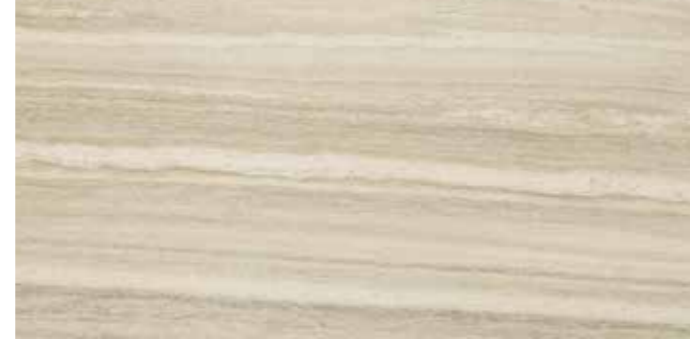
G3054A SAND RETT. 45x90 - 17,7"x35,5" 65 G3055A SAND LAPP. RETT. 45x90 - 17,7"x35,5" 66