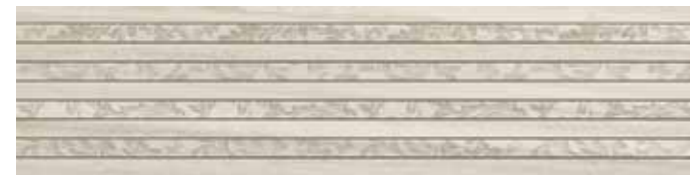
G30833 IVORY FASCIA PREINCISA FLOREALE 22,5x90 - 8,8"x35,5" 66