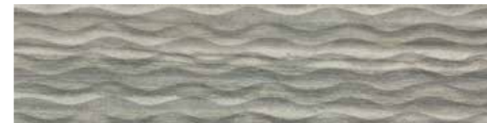
G30822 IRON FASCIA WAVE 22,5x90 - 8,8"x35,5" 47