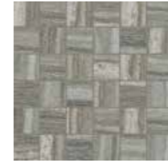
G30507 IRON NAT. MOSAICO 30x30 - 12"x12" 14 G30508 IRON LAPP. MOSAICO 30x30 - 12"x12" 15